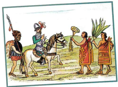
Culture • The Aztecs had never seen horses and believed that Spanish soldiers rode giant deer. ▲

TENOCHTILÁN, AZTEC CAPITAL, A.D. 1519 —Frightening news has arrived from the coast. Warriors from a land called “Spain” are marching toward the capital of our Aztec Empire. They are covered in metal armor and have thundering weapons. They have no respect for our gods, our temples, or our customs. Because we have never seen warriors like these, we do not know if they are men or gods. Nor do we know why are they coming toward our city. Some of our priests say these invaders have come to destroy our world.